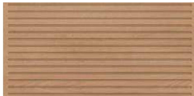
60x120 24"x48" Gracewood Deco Natural 60120