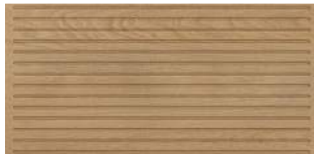
60x120 24"x48" Gracewood Deco Walnut 60120