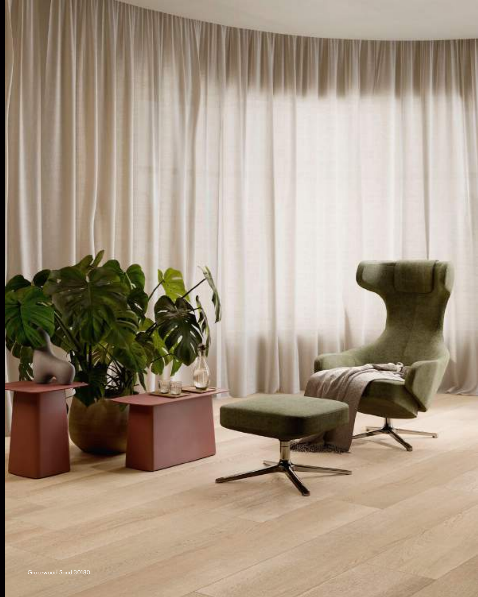
Gracewood Sand 30180