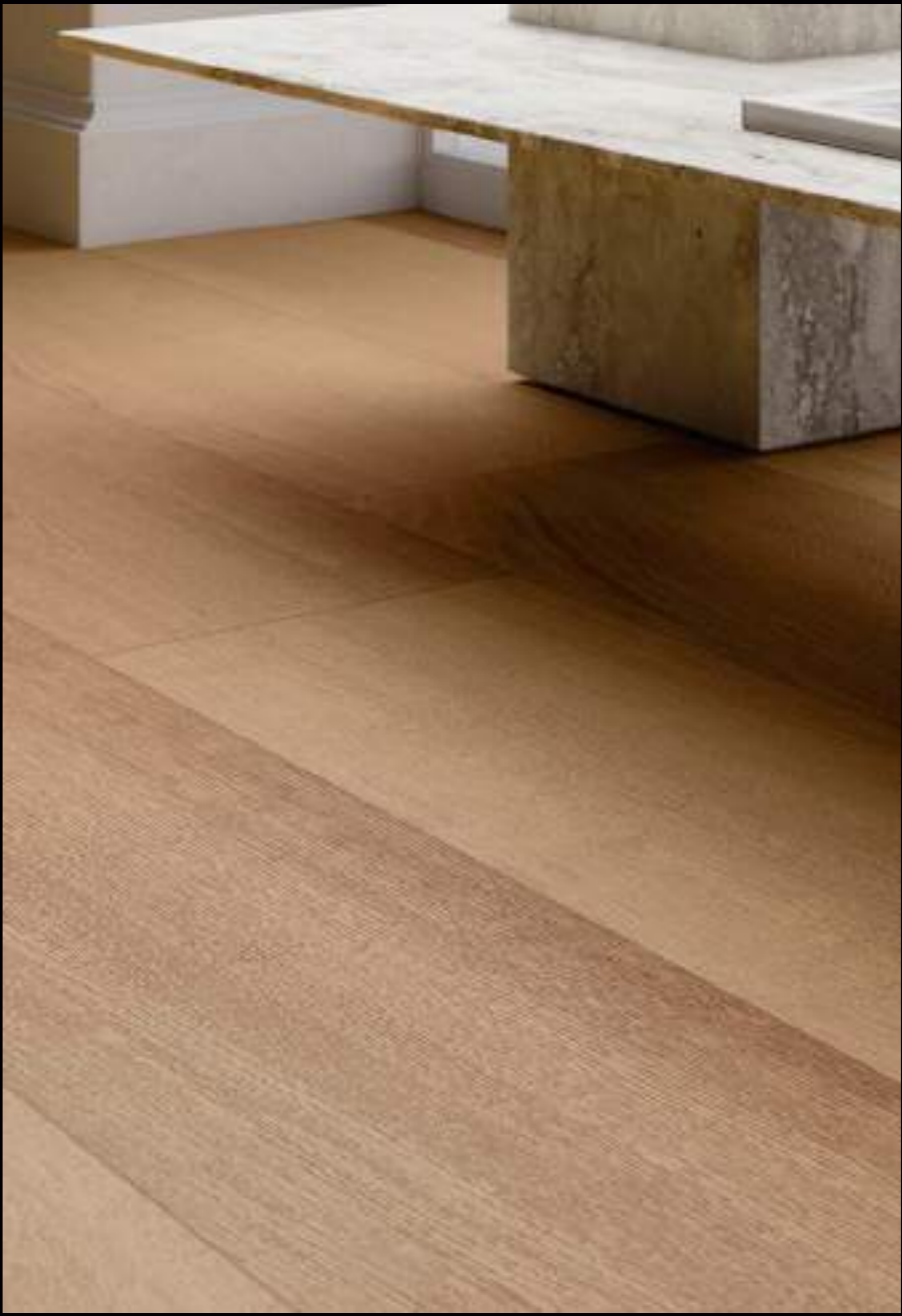
Gracewood Natural 30180