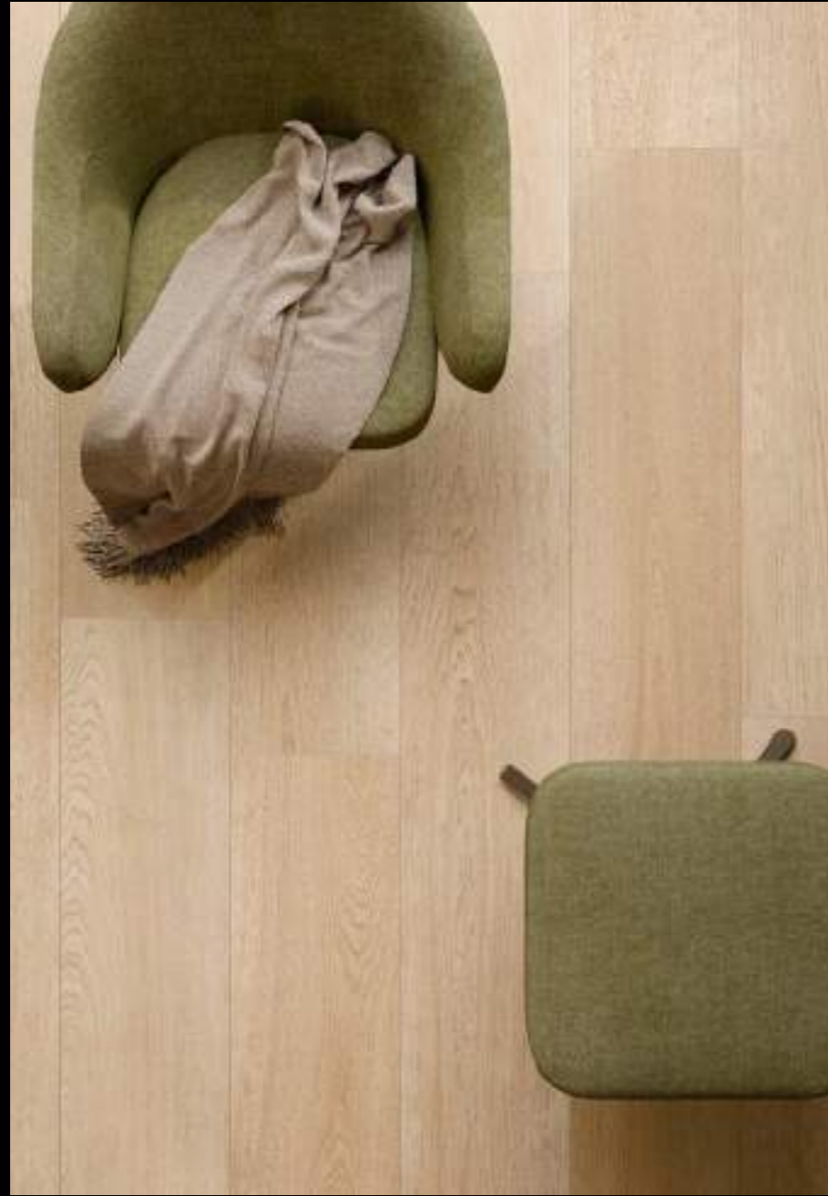
Gracewood Sand 30180