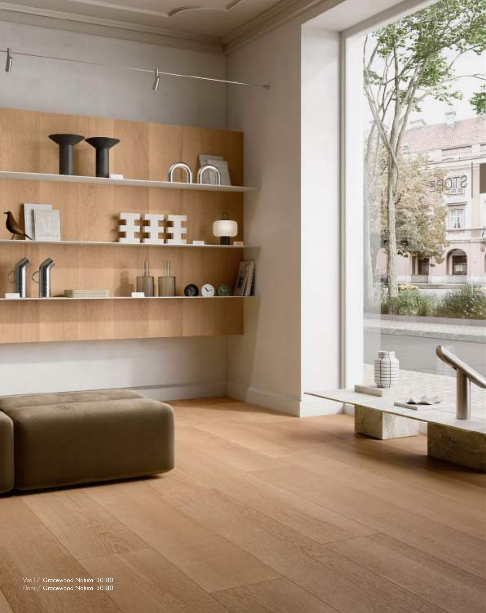
Wall / Gracewood Natural 30180 Floor / Gracewood Natural 30180